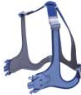
Set & Forget Headgear – no readjustment needed