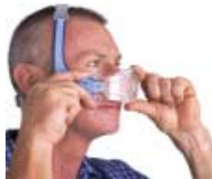
Easy-lock Parts – easier handling