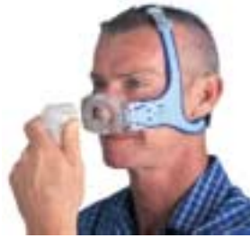
One Snap Elbow – easy and convenient