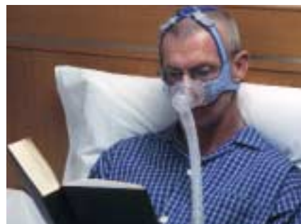
The Mirage Vista allows patients to follow their normal bedtime routines prior to sleep.