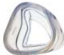
Mirage Cushion Technology – soft but with optimum seal